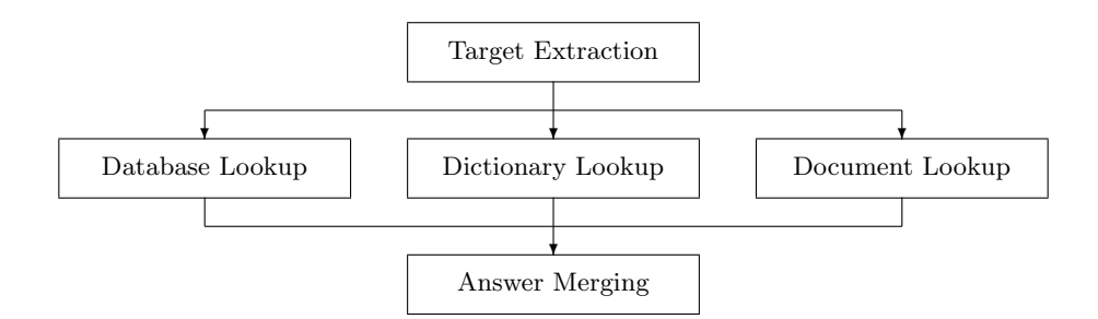
Figure 2: Architecture for answering definition questions.

Our system correctly identifies the question focus as "U.S. state" (corresponding to the target type US STATE) and extracts all instances of U.S. states from top ranking passages. Since the passage retrieval algorithm returns passages that already have occurrences of terms from the question, instances of the target type are likely to be the correct answer.