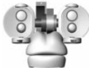
Figure 5: The caricature version of the eye surrounds combined with a monkey like jaw.