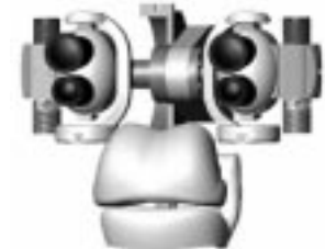
Figure 6: A monkey like jaw combined with an early version of the eye surrounds that was smaller and more oval.

The eyes are largely the focal point in human-robot social interaction, and the saliency and proportion of the eyes are crucial. Discrepancies from the proportions of humans tend to appear either as cartoon caricature or as oddly unsettling realism. Our choice of inter-ocular distance helped achieve a balance between these extremes.