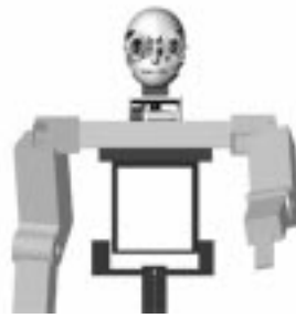
Figure 2: Cog's present torso and the new face.