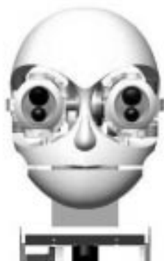
Figure 4: The first prototype of Cog's face as implemented via solid modeling. This is a Solid-Works image.